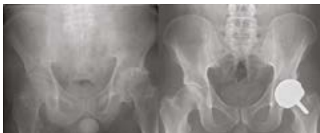
Figure-1,2. Pre operative and post operative radiographs of a patient undergoing hip resurfacing.