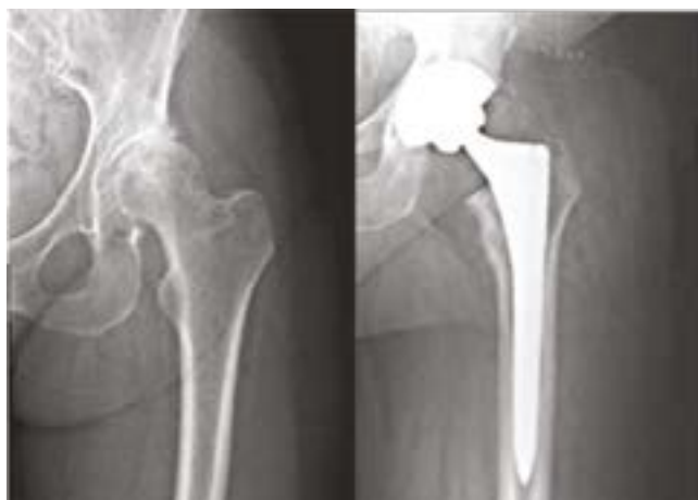
Figure-3,4. Pre operative and post operative radiographs of a patient undergoing Total hip arthroplasty.

No dislocations were observed after the revision surgical procedures. In the THA group from the patients who required revision surgery, n= 3 patients came with a history of fall and underwent open reduction and internal fixation (utilizing hook plate and cerclage wire), while n= 2 suffered instability and had to undergo shell revision of the acetabulum. Further complications are listed in Table-I and Figure-1. There was no statistically significant difference in the total rates of complications among the two groups,