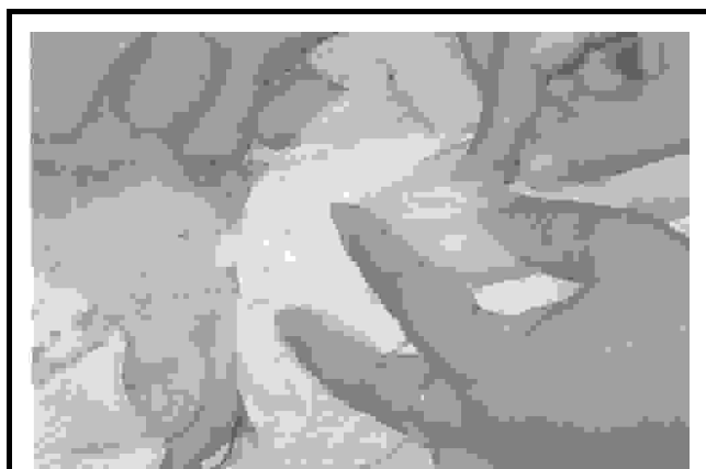
BCG vaccination done to baby at the Vaccination Centre Military Hospital Rawalpindi

Study was carried out at vaccination centre Military Hospital Rawalpindi. Here neonates are routinely given BCG vaccination within one week of birth and brought back to this vaccination centre for DPT vaccination and oral Polio vaccination at six, ten and fourteen weeks of age. It was at fourteen weeks of age when a random sample of 250 infants was documented for absence as well as formation of scar. Older infants, fulfilling the laid down criteria were also documented. A carefully designed Proforma was used for documentation.