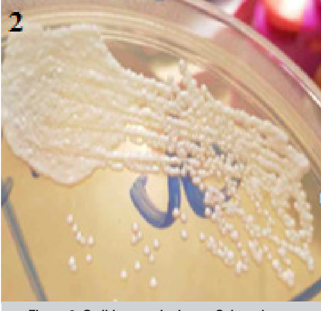
Figure-2. C.albicans colonies on Sabroud agar,