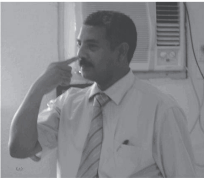
Fig-2. Acceptance of request