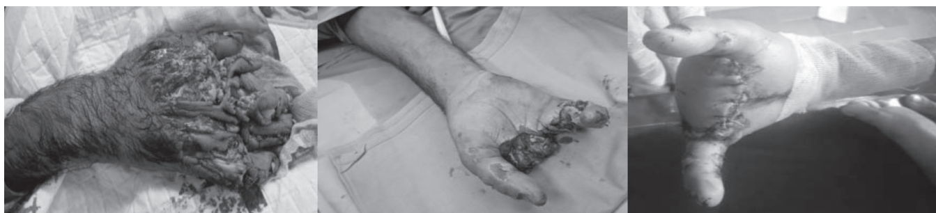
Figure-2. (Case # 5): A 25-years old, right hand dominant, laborer presented with machine injury of his right hand with severe crush injury of index, middle and ring fingers. (a) Injury (b) After debridement (c) Reverse radial forearm flap for soft tissue coverage of the defect.