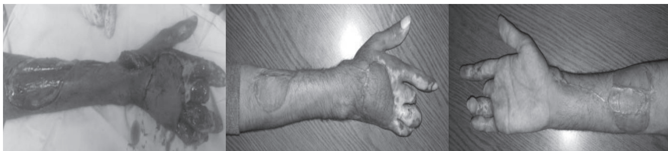
Figure-3. (Case # 3): A 28-years old, right hand dominant, presented with road traffic accident of his right hand with severe crush injury of middle fingers (a) Flap inset at the defect after debridement (b) After 6 weeks of procedure (c) Skin grafting at the donor site.