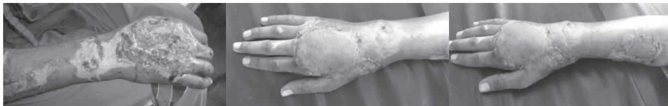
Figure-4. (Case # 2): A 38-years old, right hand dominant, presented with friction burn due to road traffic accident of his right hand with exposed extensor tendons (a) Injury at the time of presentation (b) After 2 months of procedure (c) After 3 months with skin grafting at the donor site.