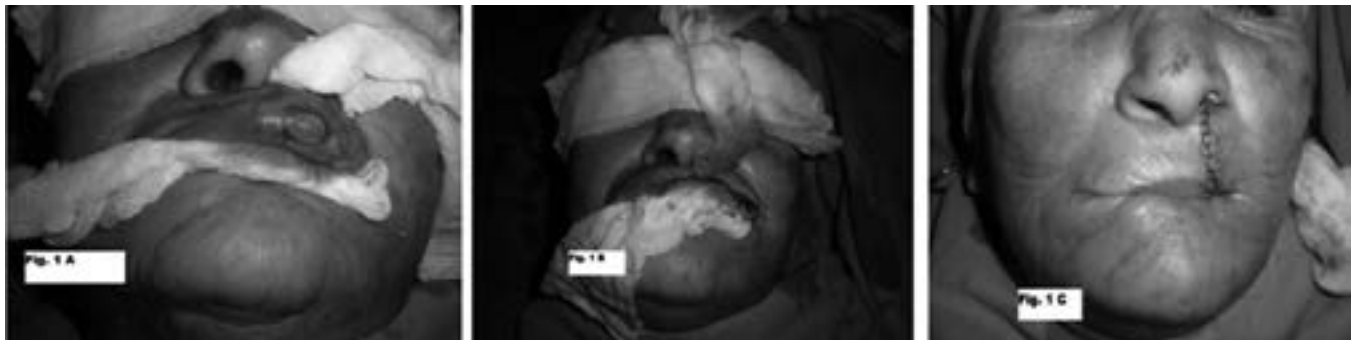
Figure-1. A 60 year's old lady (case 6) with squamous cell carcinoma of left side of upper lip (Figure-1 A). Post excision 50% defect (Fig-1 B) reconstructed with lip and cheek advancement flap (Figure-1 C).