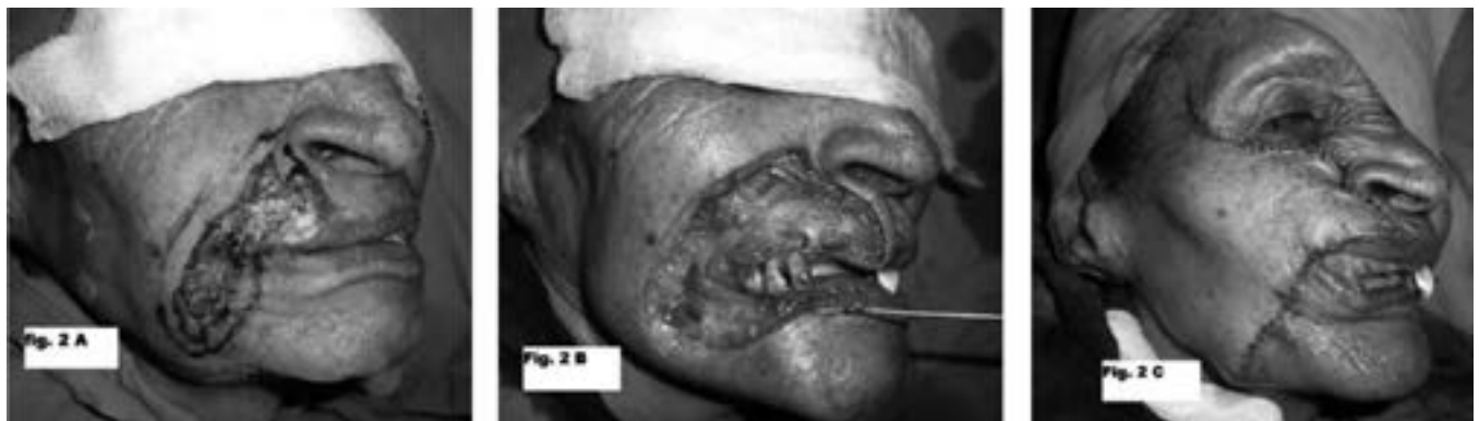
Figure-2. 75 year's female (case 5) with squamous cell carcinoma involving oral commissure (Figure-2 A). Defect after excision of tumor (Figure-2 B). Reconstruction with cheek advancement flap Figure-2 C).

achieved with cheek advancement flaps in all the patients and no revision surgery was required. In a study carried out by Graffin 5 , revision surgery was performed in 47% cases. The reason was location of lip defects involving ala of nose and lip vermillion requiring improvement of the residual scars and relatively young patients. Severe microstomia developed in one patient, in which cheek advancement and lip switch flaps were done simultaneously to repair the upper lip segment.