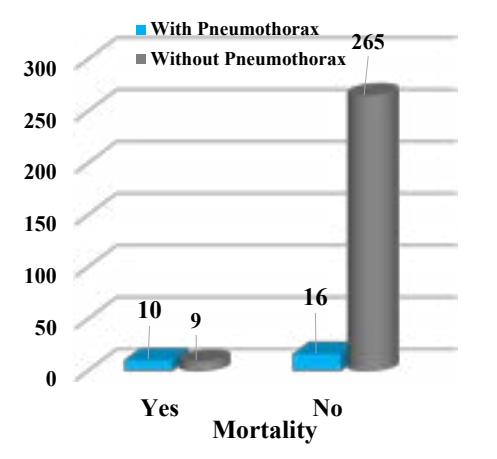
Figure-2. Incidence of Mortality in patients with pneumothorax and without pneumothorax.