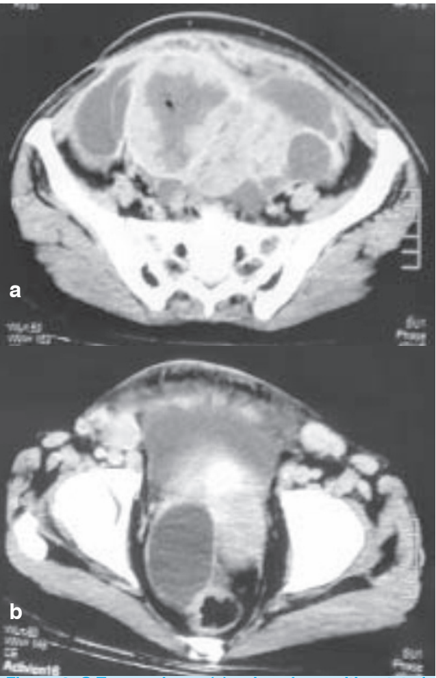
Figure-3. C.T scan shows (a) enhancing multiseptated cystic mass noted in pelvis (b) abutting and compression the rectosigmoid colon and urinary bladder