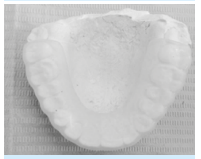
Fig-2. Michigan splint on cast

While history taking, it was revealed almost all the patients were suffering with acute anxiety. In this study, most of the patients were females suffering from family problems. Males who were suffering with TMD were students or having job related problems or financial problems. In present study eighty percent of patients were females and twenty percent of the patients were males and adequate time was given to the patient. While history taking, patients were listened to very well, so they could speak out their reason for anxiety.<sup>9</sup>