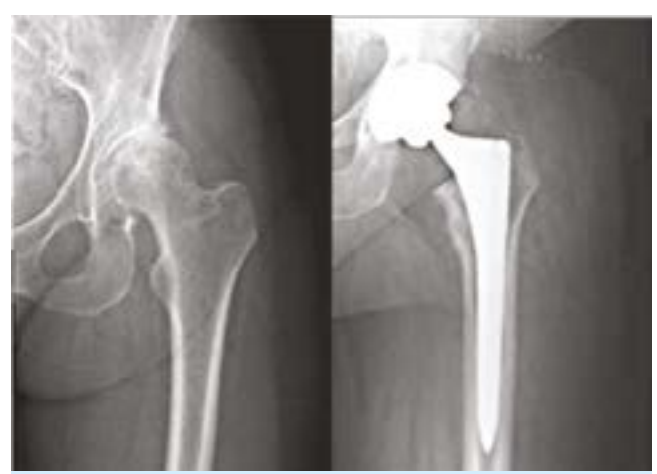
Figure-3,4. Pre operative and post operative radiographs of a patient undergoing Total hip arthroplasty.

No dislocations were observed after the revision surgical procedures. In the THA group from the patients who required revision surgery, n= 3 patients came with a history of fall and underwent open reduction and internal fixation (utilizing hook plate and cerclage wire), while n= 2 suffered instability and had to undergo shell revision of the acetabulum. Further complications are listed in Table-I and Figure-1. There was no statistically significant difference in the total rates of complications among the two groups,