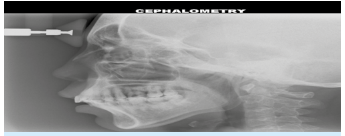
Figure-3. Lateral cephalogram showing, widening of diploic space and salt and pepper appearance of the skull.