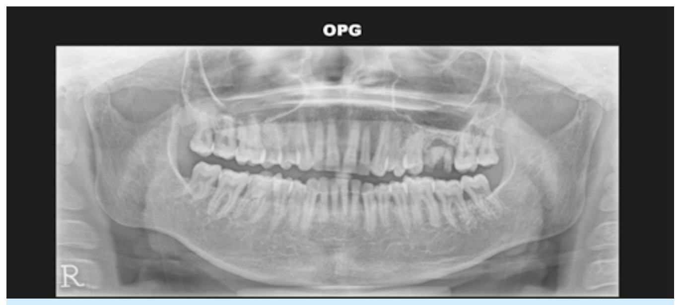
Figure-2. OPG showing presence of alteration of trabecular pattern and short spiky roots

Figure-1.A Showing icterus in the eyes, Showing classical "Chipmunk facies" with depressed Cranial vault, frontal bossing, maxillary expansion, retracted upper lip and saddle nose. B. lateral view of patient shows maxillary prognatism and retrognatism of mandible. C. shows The gingival recession and gingivitis and generalized heavy deposition ofplaque and calculus with heavy stains. D. Showing yellowish tinge at the junction of hard and soft palate