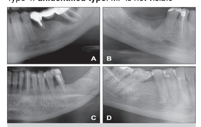
Figure-1. The appearance of MF on panoramic radiograph, according to Yosue and Brooks classification A: continuous type, B: separated type, C: diffuse type, D: unidentified type<sup>33</sup>

Type 3: diffuse type : MF has indistinct borders Type 4: unidentified type : MF is not visible