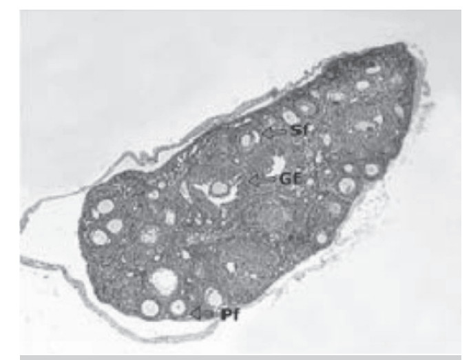
Histological section of Ovary of control group A showing three types of follicles

The mean ovary weight of group (A) animal was 0.0185 gm (SD=0.000527) (in accordance with our previous article)<sup>13</sup> and in experimental group (B) was 0.0183 gm (SD=0.000483). The mean