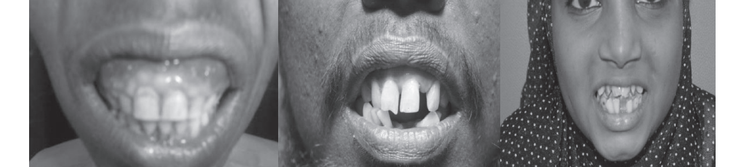
Figure-(A) Figure-(B) Figure-(C)

Photograph (A-C) (A), shows heavy deposition of plaque and calculus and marked swelling of gingiva and muddy black colour of oral mucosa, (B) shows Spacing between the teeth (C)Shows Mal align teeth with heavy deposition of plaque and calculus.