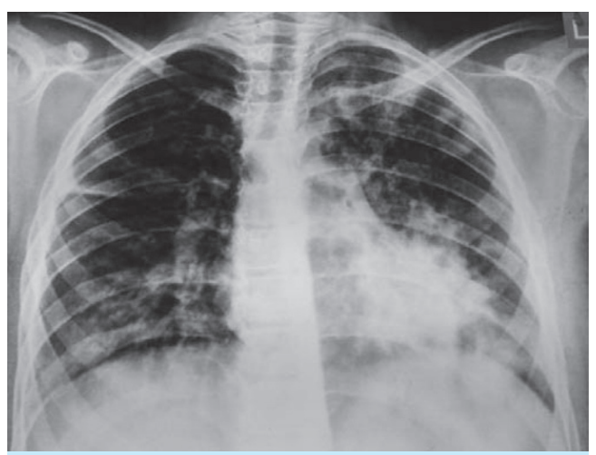
Figure-1. Chest-Xray showing bilateral lung infiltrates along with prominent radio-opacity on left side.

respectively. Auscultation of chest revealed bronchial breathing on left side with bilateral crepitations and ronchi. Her complete blood picture showed TLC, 22000/mm³ (polys-80%, lympho-7%, Eosin-10%). C-Reactive Protein was positive and erythrocyte sedimentation rate (ESR) was 50mm/hr. Her metabolic profile was normal. Chest-Xray revealed radio-opacity on left side (Figure-1) while USG chest revealed left lung consolidation with mild pleural effusion and decreased movements of left hemi-diaphragm.