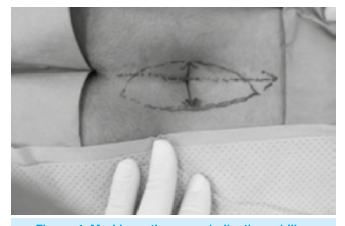
Figure-4. Markings, the arrow indicating midline

The flap side is mobilized in a plane above the gluteal muscles (Figure-6)