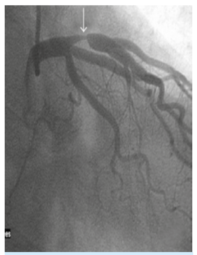
Figure-3. Conventional Coronary Angiogram confirms the severe stenosis in proximal LAD (white arrow).

Regarding the LAD disease 17 (35.4%) patients had severe CAD with CAC score between 101-400 and all the patients 2(4.2%) who had CAC score >400 had severe CAD.Regarding disease in RCA 89(45.64%) patients had severe CAD and most of these patients had CACS >200. Two patients had CACS >400 and all were suffering from severe disease in RCA. Regarding disease in left Circumflex artery, 56(98%) with zero calcium had no disease but there was only 1 patient who had CAC >400 and was suffering from severe disease.