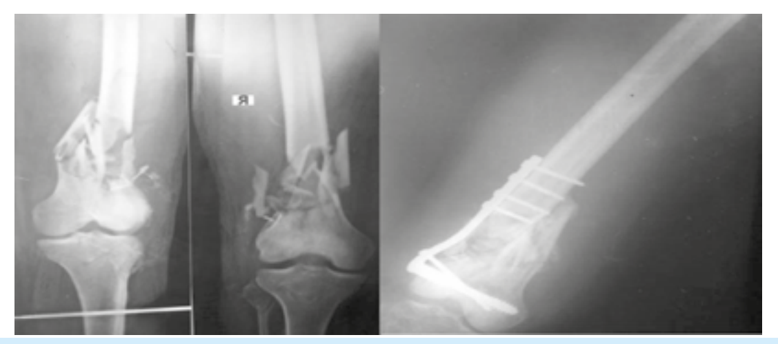
Pre-Operative X-ray Post-Operative X-ray (DCS