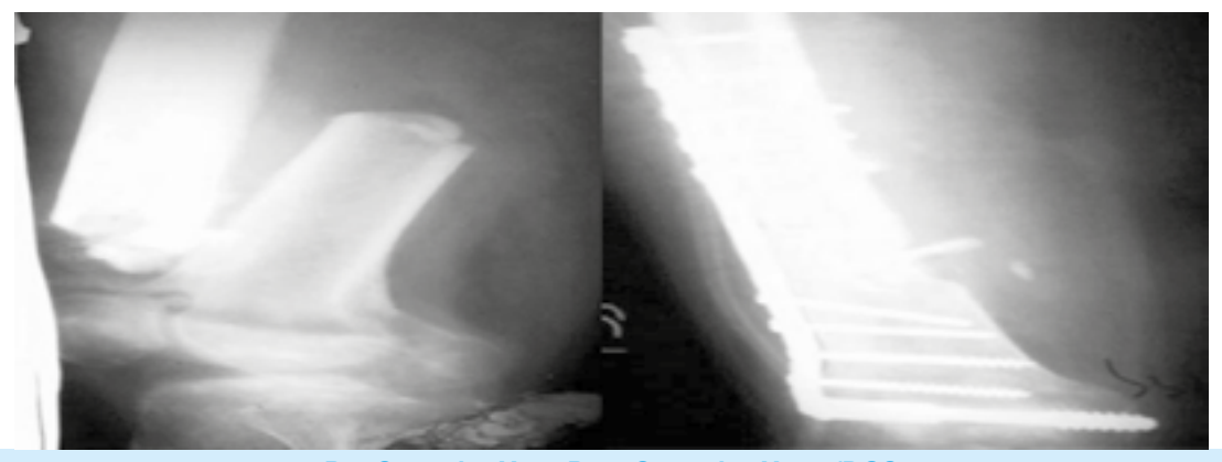
Pre-Operative X-ray Post-Operative X-ray (DCS