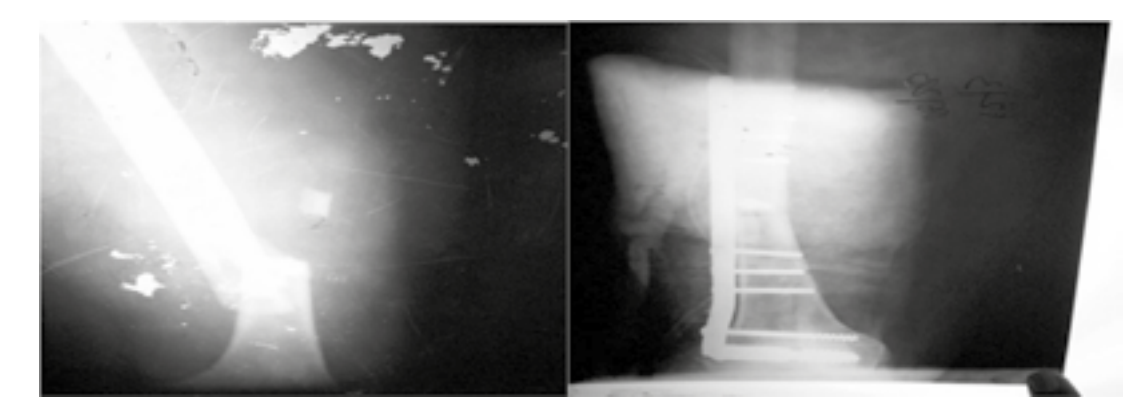
Pre-Operative X-ray Post-Operative X-ray (DCS